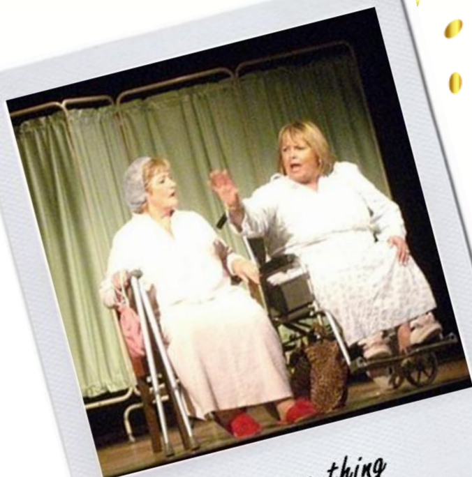
Doing our thing