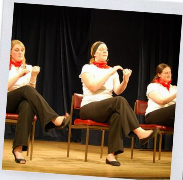
...and it's goodnight from him