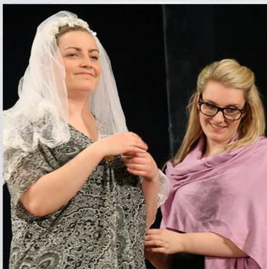
25 not out