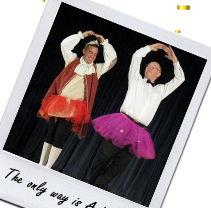
The only way is Ashtead