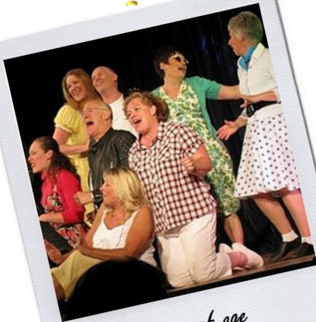
Coming of age